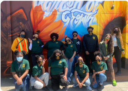
YAP Members, Youth Leaders Collective, Muralists, YAP Leaders, volunteer and Director at the Youth ARTS Celebration, May 2021