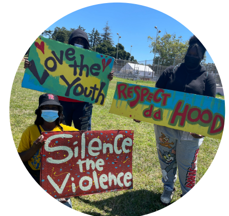
Youth Activists at the Mini-peace march during Silence the Violence Event, June 2021

After supporting the Military Equipment Ordinance for almost 3 years, it was unanimously voted into effect by Oakland's City Council in June 2021! Together, we hosted a Demilitarization Town Hall and a Demilitarize OPD Advocacy training (engaging over 100 community members) helped collect nearly 1500 petition signatures, garnered support from over 30 local organizations and collected over 500 postcards. A very special thanks to the American Friends Service Committee and the Council on American Islamic Relations - Bay Area, for valuing our leadership and allowing our youth to be part of the fight for demilitarization here in the Bay Area!