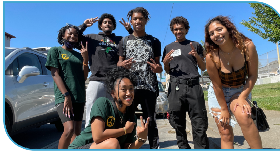
Youth ARTS Members, youth volunteers and Director at Silence the Violence, June 2021